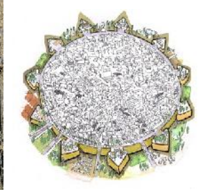
old Nicosia (walls)